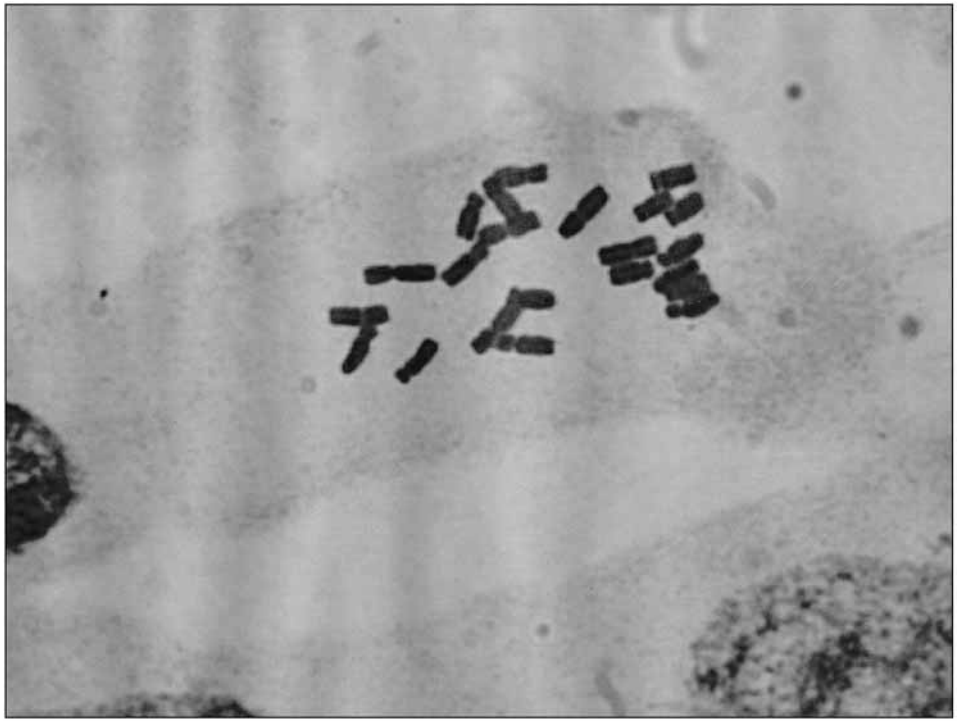
Figure 1 Metaphase at – Echinacea purpurea (2n=22)