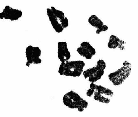
Figure 1 Metaphasis at Vicia sparsiflora Ten.

The chromosomes pairs I, II, III have the branch ratio between 3.20 and 5.06; they are from subtelocentric type. The chromosomes pairs IV, V, and VI, have the branch ratio between 2.37 and 2.72, being from submetacentric type (Figure 1, Figure 2, Figure 3).